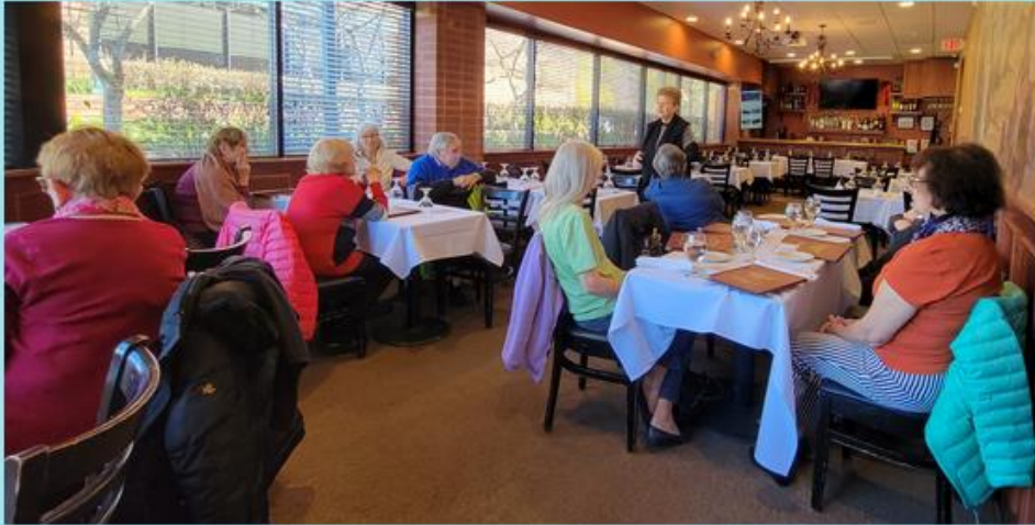
PCV Members at Il Porto for our monthly luncheon.